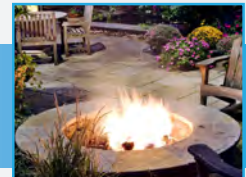
GAS FIRE PITS

Call our office today at (800) 237-3835 to schedule your annual maintenance, or improve your home by installing any of the equipment items above!