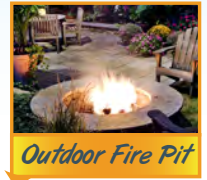
Outdoor Fire Pit